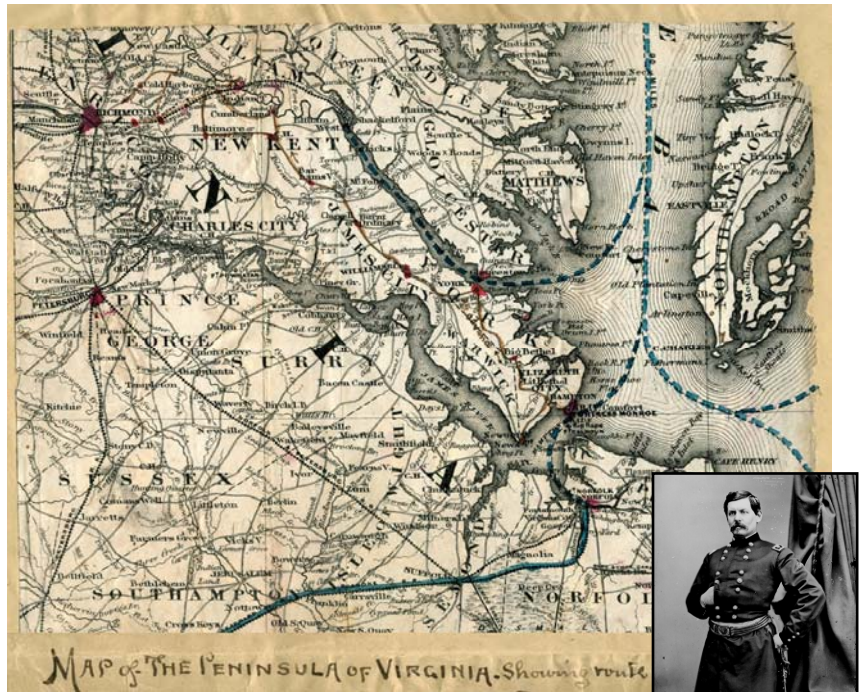
The Virginia Peninsula Showing the York and James Rivers and Their Tributaries Planned as Conduits for McClellan's March on the Confederate Capital of Richmond (inset: Gen. George B. McClellan).

The Union campaign stalled outside Richmond, and in July 1862, McClellan abandoned his efforts to take the city, retreating instead to Fort Monroe. During the retreat, ships, barges and supplies were either left behind or burned to keep them from being captured by the Confederates. Research indicates that many of the barges and ships used around White House Landing may have suffered this fate. It is the remains of these vessels that MAHS hopes to locate and survey over the next several years.