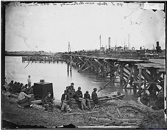
Bridge over the Pamunkey River at White House Landing under repair ca. 1862, with locomotive in right background.