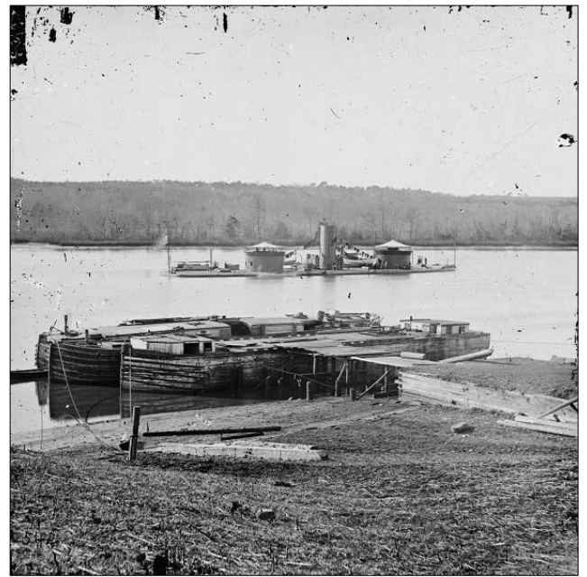
Barges moored parallel to the shoreline to create a temporary wharf, with a double-turreted ironclad in the background.

creating the type of temporary wharf seen in historical photographs of the White House Landing.