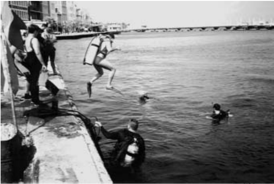
The field school continued the next day on the Mediator site in the Willemstad Harbor.