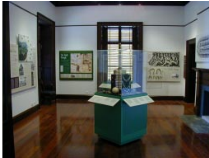
Slave trade exhibit at the Bermuda Maritime Museum.