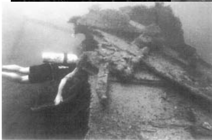
Theo looking into the hold of the Mediator