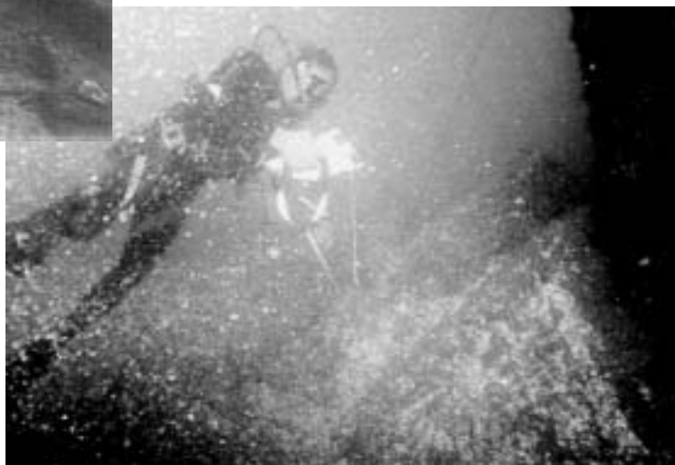
Some days, visibility was better than others. (Bob Spier taking trilateration measurements)