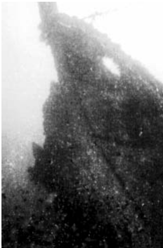
Most of the dives were on the Mediator — this is a shot of the bow.

In June a team of MAHS volunteers travelled to Curaçao to continue work on the Mediator wreck site. In addition, they conducted the Basic Underwater Archeology Course using MAHS' videotape instructional series, Diving Into History , and followed up with a field school. As the following photo essay attests, it must have been a very busy time for the MAHS team as well as their hosts and student participants from the island. Be sure to check the next edition of MAHSNews for a full report on the activities.